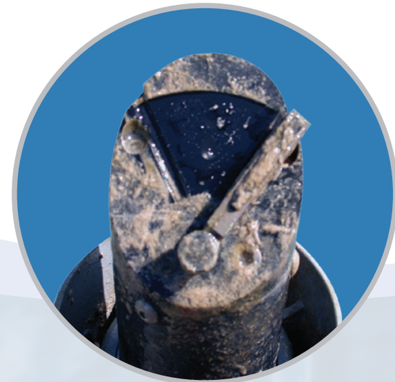
Despite significant bio-fouling after a 12 month deployment, the optical face of the DTS-12 is clean and perfectly operational.

The DTS-12 is the first sensor to make turbidity monitoring practical. The value of continuously monitoring turbidity has long been accepted, but it's always been difficult, inaccurate, expensive, labor-intensive, and therefore often dismissed as too impractical. The DTS-12 is different—we state with confidence that it's the “world's best” because its unique design delivers extremely low maintenance (just clean and re-calibrate once a year) and extremely high accuracy over the full measurable range of 0-1,600NTU. Unlike multisondes, the DTS-12 does one task, but does it exceptionally well and it is also less expensive and simpler to deploy.