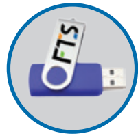
Transfer data or firmware updates via standard USB memory sticks