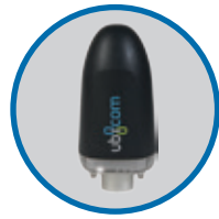
Uvicom 2-way remote management

For added reliability and 2-way remote management of the station, cellular and/or Iridium satellite telemetry can be easily added with Uvicom.